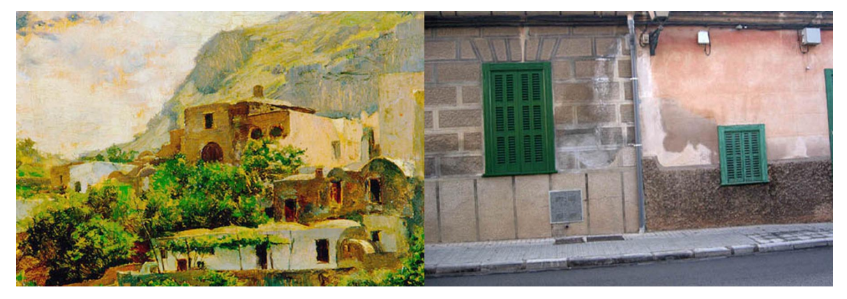
Fig. 1. Two examples of the stimuli used in the experiment. (Left) "Paisaje de Capri" (1878), painting by Francisco Pradilla y Ortiz, printed with permission from the Museo Nacional del Prado (Madrid, Spain) Archivo fotográfico. (Right) Photograph of an urban landscape.

regions. Fig. 3 shows the areas that were more activated in beautiful than in not-beautiful perception, regardless of the participant's gender (that is, the main effects of aesthetic preference).